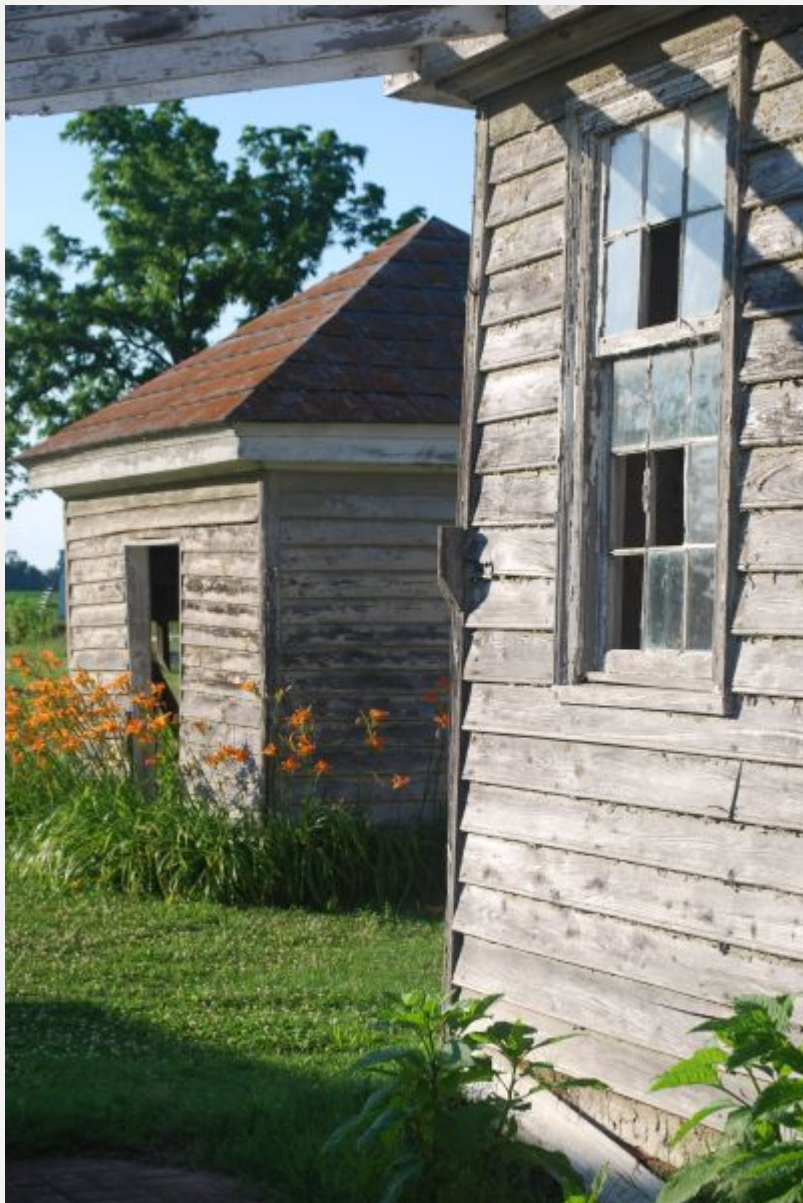
Smokehouse and Summer Kitchen Outbuildings

Over the next century, Belle Grove would have a series of owners and overseers. But in 1987, the Fraz Haas Corporation bought the property and embarked on its historical restoration. The Darnells signed their lease on the property in 2012 with their dream of turning it into a bed and breakfast.