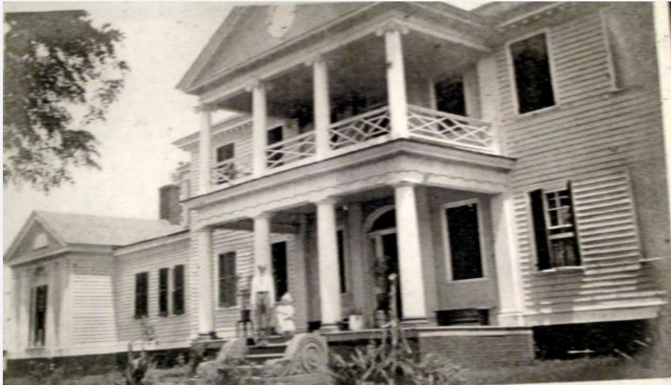
Belle Grove 1906