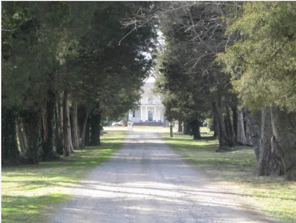
The entry drive to the Mansion

The photos on this post were the ones that ran with the article.