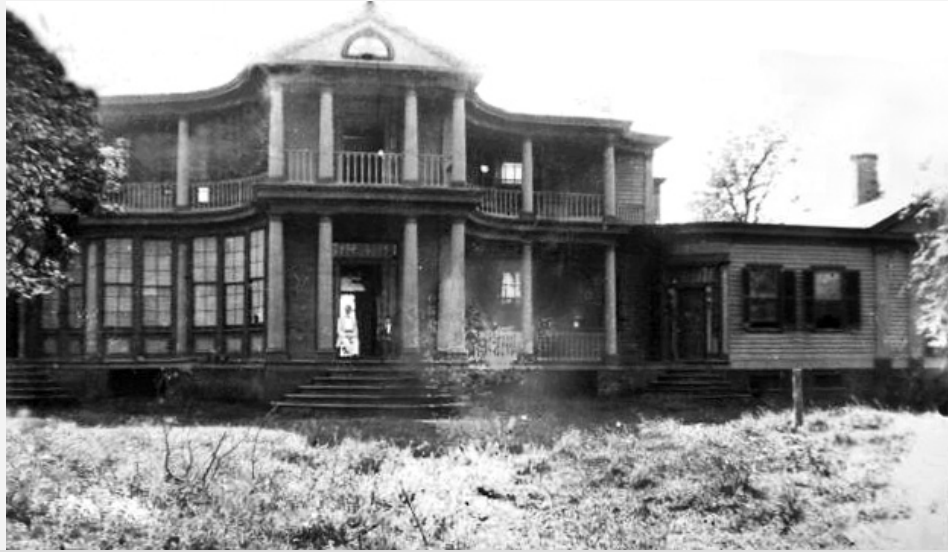
First known photo of Belle Grove 1894

The plantation is believed to have been used as a Union Army headquarters during the Civil War, which explain why it was undamaged by Union gunboats moving up and down the Rappahannock during the war.