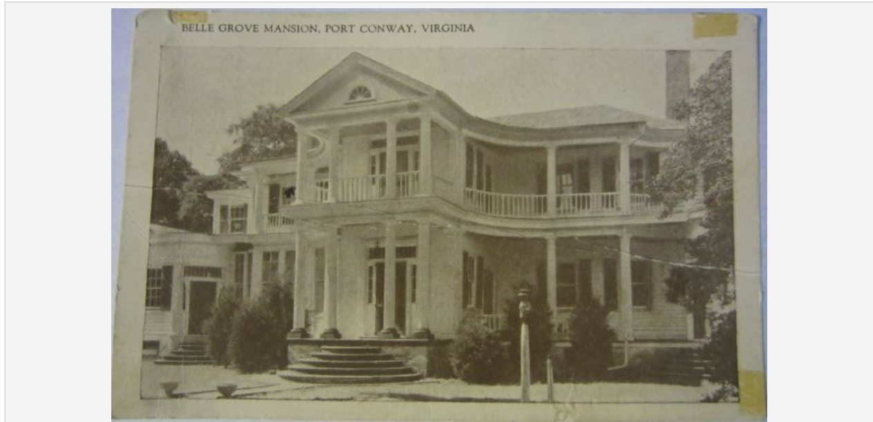
Postcard of Belle Grove 1950s