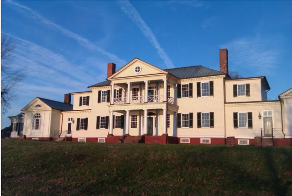
The Riverside of the Mansion at Sunset