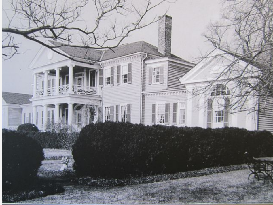
Belle Grove 1937 Riverview side

The Darnells are leasing the Belle Grove estate from Haas Belle Grove, Inc. which bought the plantation in 1987 and spent $3.5 million in historical renovation which was completed in 2003. If they received their permit from the Board of Supervisors, the Darnells will be making their own improvements including repairing the road to the historic plantation, building a parking lot and landscaping.